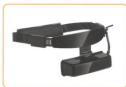
I-Scan® V1 Video Goggles