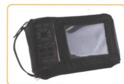
leather protector on farm (easy-clean by running water)