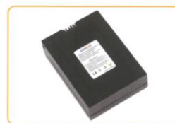
Li-ion high-power -capacity battery