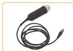
mechanical sector probe (2.5/3.5/5.0 Mhz, adjustable)